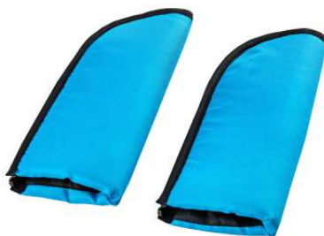
7. SIDE COVERS FOR FOLDING MECHANISM