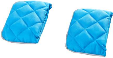
8. SIDE SUPPORTING PANNELS FOR CALVES