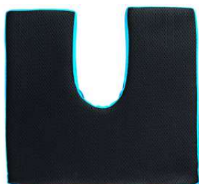
5. CUSHION FOR SEAT