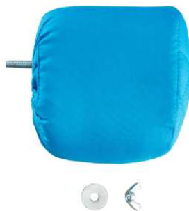
3. ABDUCTION BLOCK