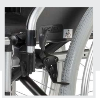
Knee lever brake