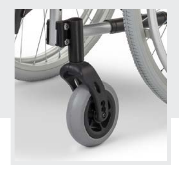
Angle of steering head is adjustable