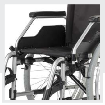
Modifications are quick and precise