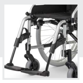
Leg rests can be swung inwards and outwards