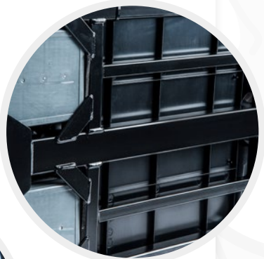
Extremely robust platform