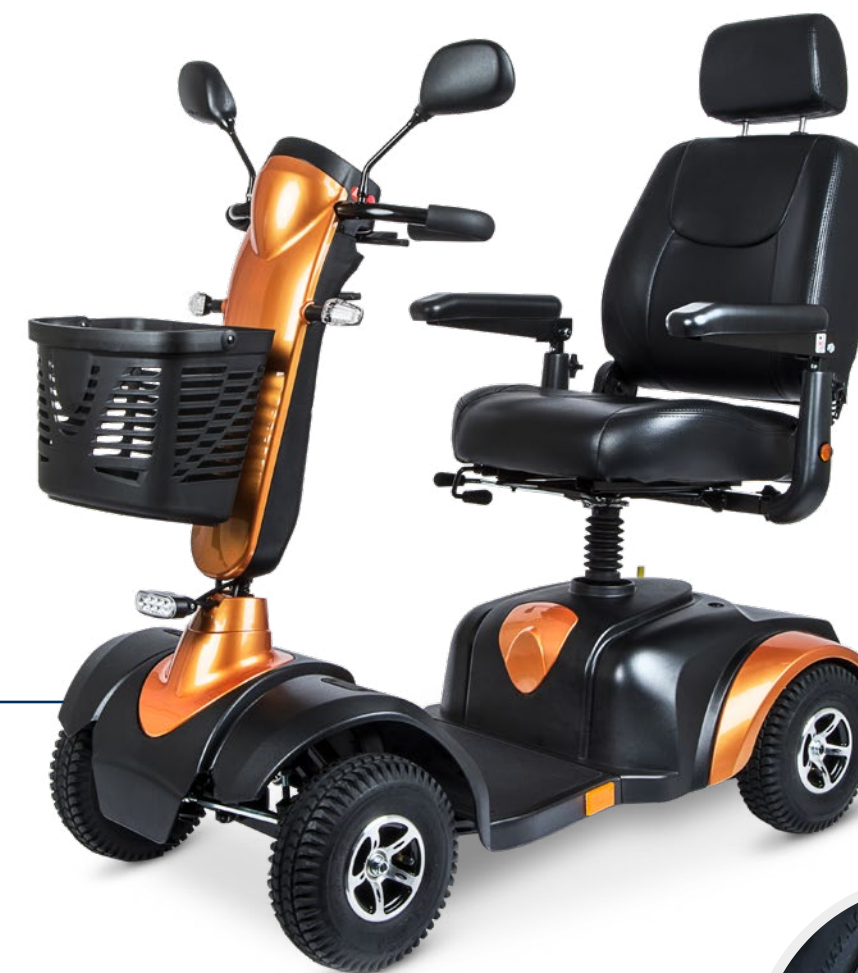
Modern design with pleasing shapes in trendy colors