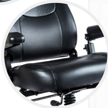
Sprung comfort seat system, large legroom and stepless seat adjustment