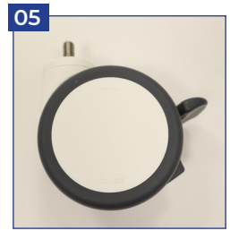
Double castors 100 mm