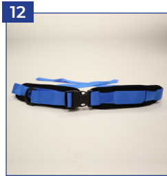
Lap belt with neopren pads