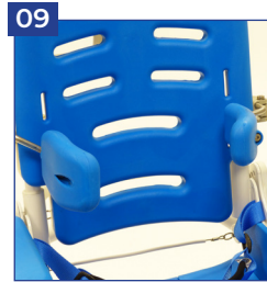
Lateral PU pads