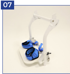
Footrest system, angle adjustable