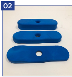
PU-hip support pads