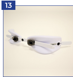
A2J Pelvic-retraction belt