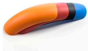
Colour-kit (mudguard) included in delivery