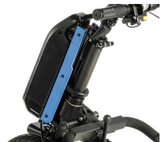
Colour-kit (sidebars) included in delivery (accent colour blue)