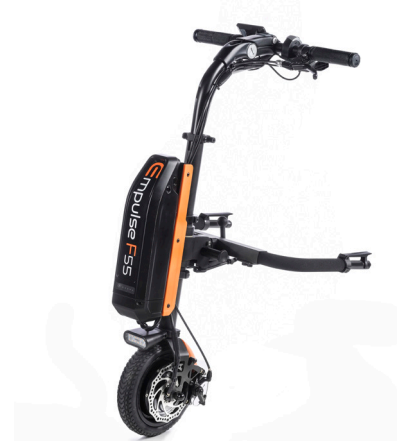
// EMF070085 Drive wheel 8.5", solid tyre (Pictured with EMF010028 Docking for swing-away wheelchairs with longer sub frame tubes and swannecked steering tube. Orange colour accents)