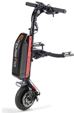
// EMF070085 Drive wheel 8,5", solid tyre (Pictured with EMF010027 docking for fixed-front wheelchairs and red colour accents)