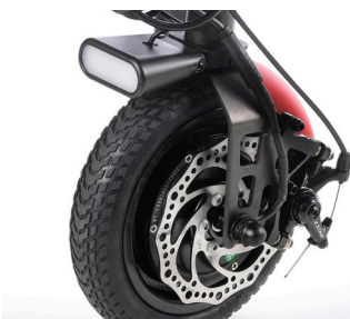
LED-light, Fender (accent colour red) and disc-brake (pictured on EMF070085 Drive wheel 8,5", solid tyre)