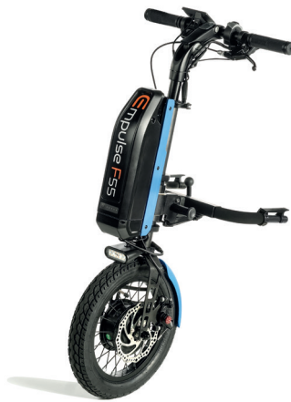
// EMF070086 Drive wheel 14", pneumatic tyre (Pictured with EMF010027 Docking for fixed-front wheelchairs and blue colour accents)