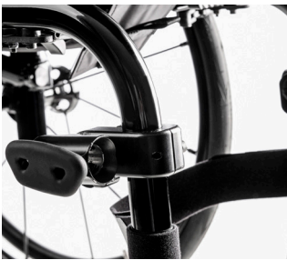
// EMF010029 Docking-clamps for round tubes frames (adaptable to 19.5 mm, 23 mm, 25 mm, 28.6 mm & 30 mm tubes)