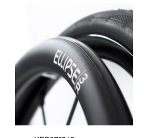
XES070212 Handrims Ellipse 3R