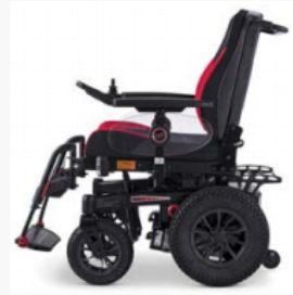
RS design black-red