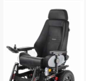
Recaro seat in black Imitation leather