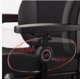
Side Panel lighting with individual engraving