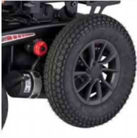
15" drive wheels