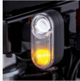
Active LED lighting