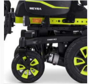
Castor wheels with aluminium rim