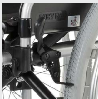
Knee lever brake