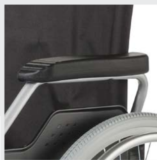
Lockable, backward-folding armrests