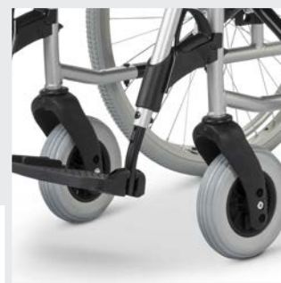
Front seat height-adjustable without swapping parts