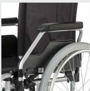
Comfort-remove side panel