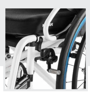
Extremely low actuating forces