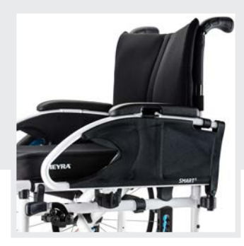
Unique side panel with height-adjustable armrest, one-handed operation