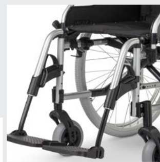
Legrests swing-away inwards and outwards