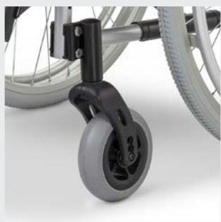
Angle-adjustable steering head