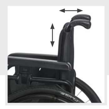
Telescopic and angle-adjustable back height for ideal adaptation to changing medical conditions