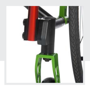
Up to 12° seat tilt for fine adjustment options