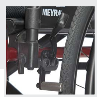
Unique brake with extremely low actuating force