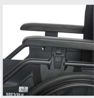
Height-adjustable side panel with one-handed operation