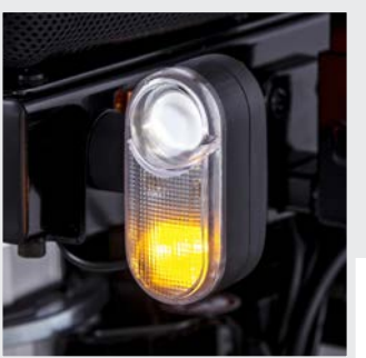
Active LED lighting