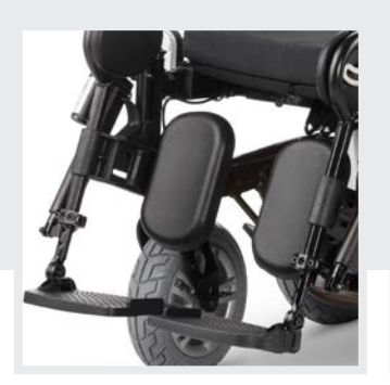
Electrically adjustable legrest available as an option