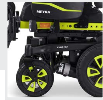
Castor wheels with aluminium rim