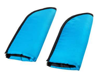
7. SIDE COVERS FOR FOLDING MECHANISM