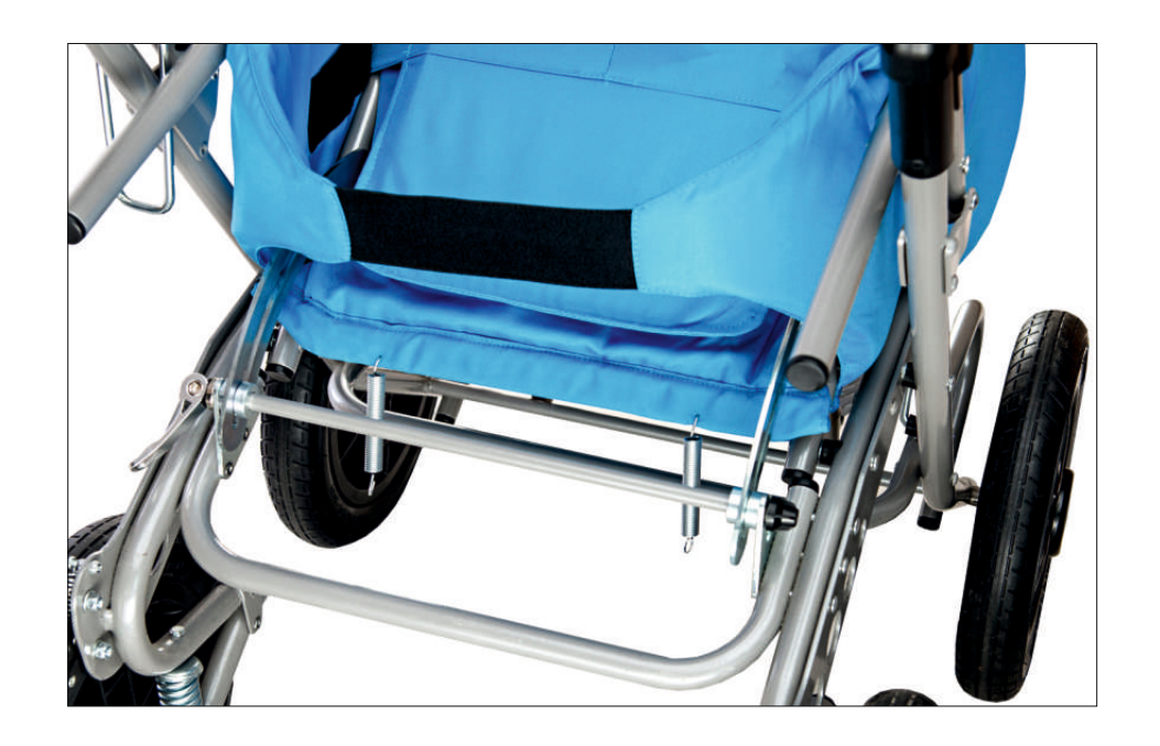
STAGE 9 . If SPRINGS (12) are mounted, it is important to bend the endings of springs with the aid of pliers.