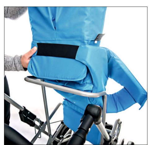
STAGE 1. Put UPHOLSTERY (1) on FRAME (2) and backrest and move it backwards.

It is necessary to follow these steps so as to mount upholstery on Racer Evo stroller: