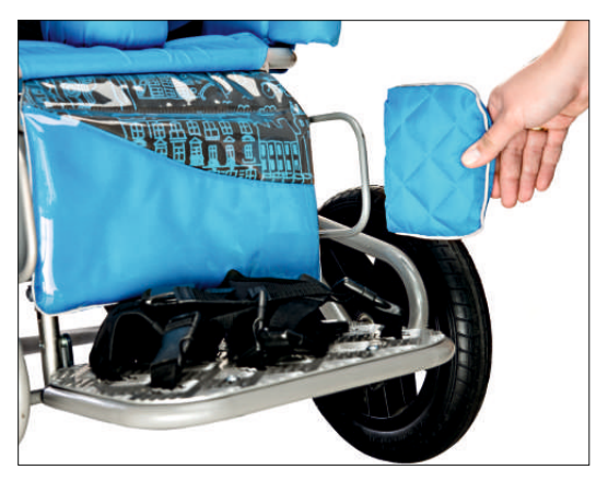
STAGE 15. Place HEADREST (6)