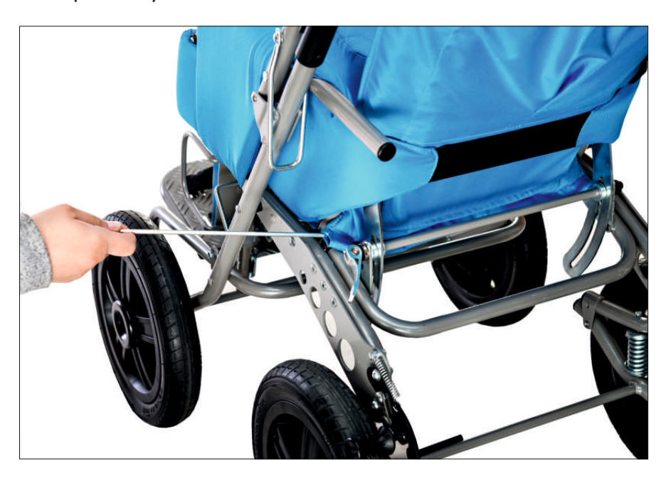
STAGE 8 . Put SPRINGS (12) behind ROD Nº 2 (14) that is situated in hole in upholstery. Take spring and "pierce" upholstery at a distance of 9cm from the end of upholstery on both sides.