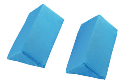
10. SIDE PELOTTES