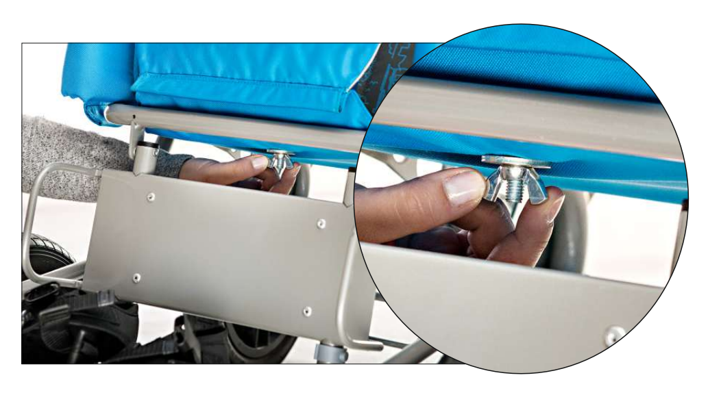
STAGE 3. Insert ROD N^{\circ} 3 (15) into hole situated at the front of seat.

Screw abduction block under the seat with the aid of knob and washer.