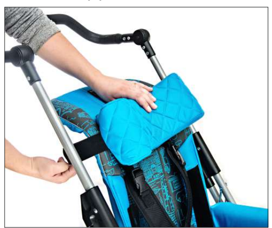
STAGE 16. Place SIDE PELOTTES (10)