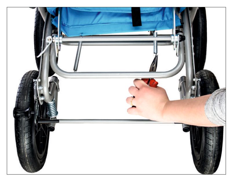
STAGE 11. Thread FASTENING BELT (11) through backrest's frame as it is illustrated in the picture below. The ending of belt should be inserted into regulator. These activities should be repeated for the second ending.