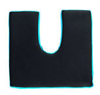
5. CUSHION FOR SEAT